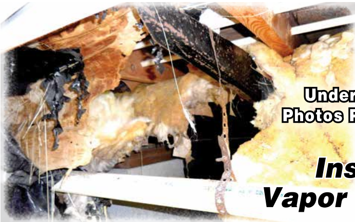
Underhome Photos Provided